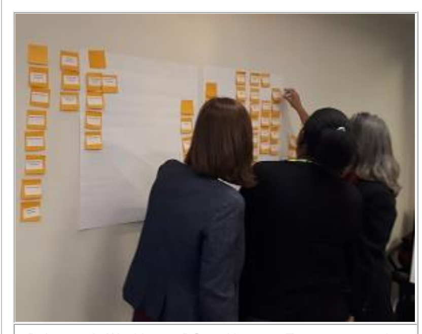
Delegates in Washington DC working on a Taxonomy exercise

Nick has been busy with a large contract in Europe, but took time out last month to deliver a set of three training courses for a client in Washington DC.