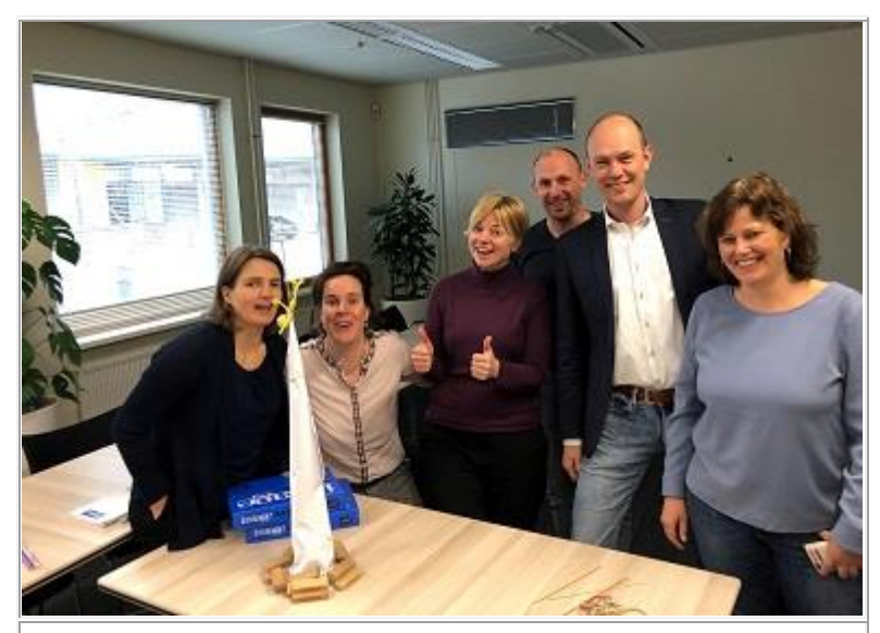
Delegates at the KM training course in the Netherlands, enjoying the Bird island exercise

Knoco Netherlands was recently involved in providing training to a local port authority. As always, the Bird Island exercise proved very successful.